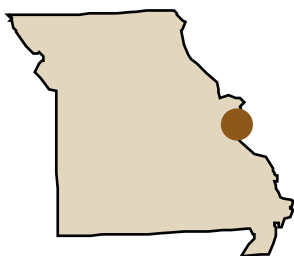
St. Louis, MO