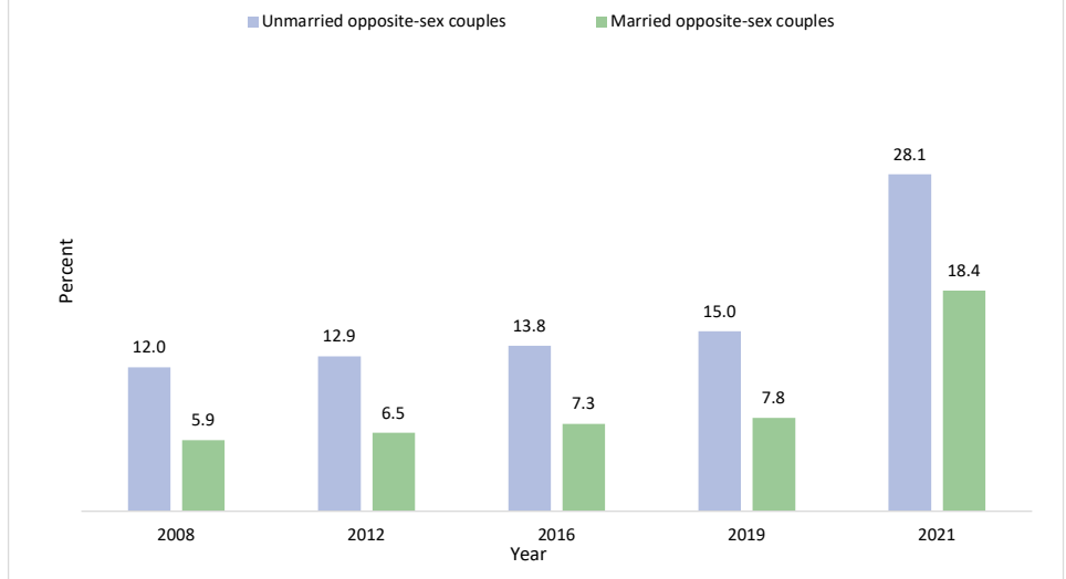
Figure 2b. Percent of Opposite-Sex Couple Households That Are Interracial for Selected Years

* Prior to 2013, those reported as same-sex spouses were shown as unmarried partners in the data. For more information, see: https://www.census.gov/library/visualizations/2020/demo/the_context_and_evolution_of_data_collection_for_same_sex_married_couple_households.html